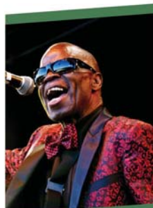
Maceo Parker & His Big Band JAN 10 th Centennial Hall