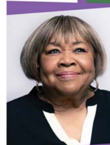
Mavis Staples JAN 19 th Fox Tucson Theatre