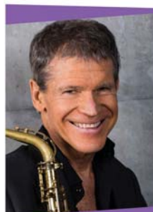
David Sanborn JAN 11 th Fox Tucson Theatre