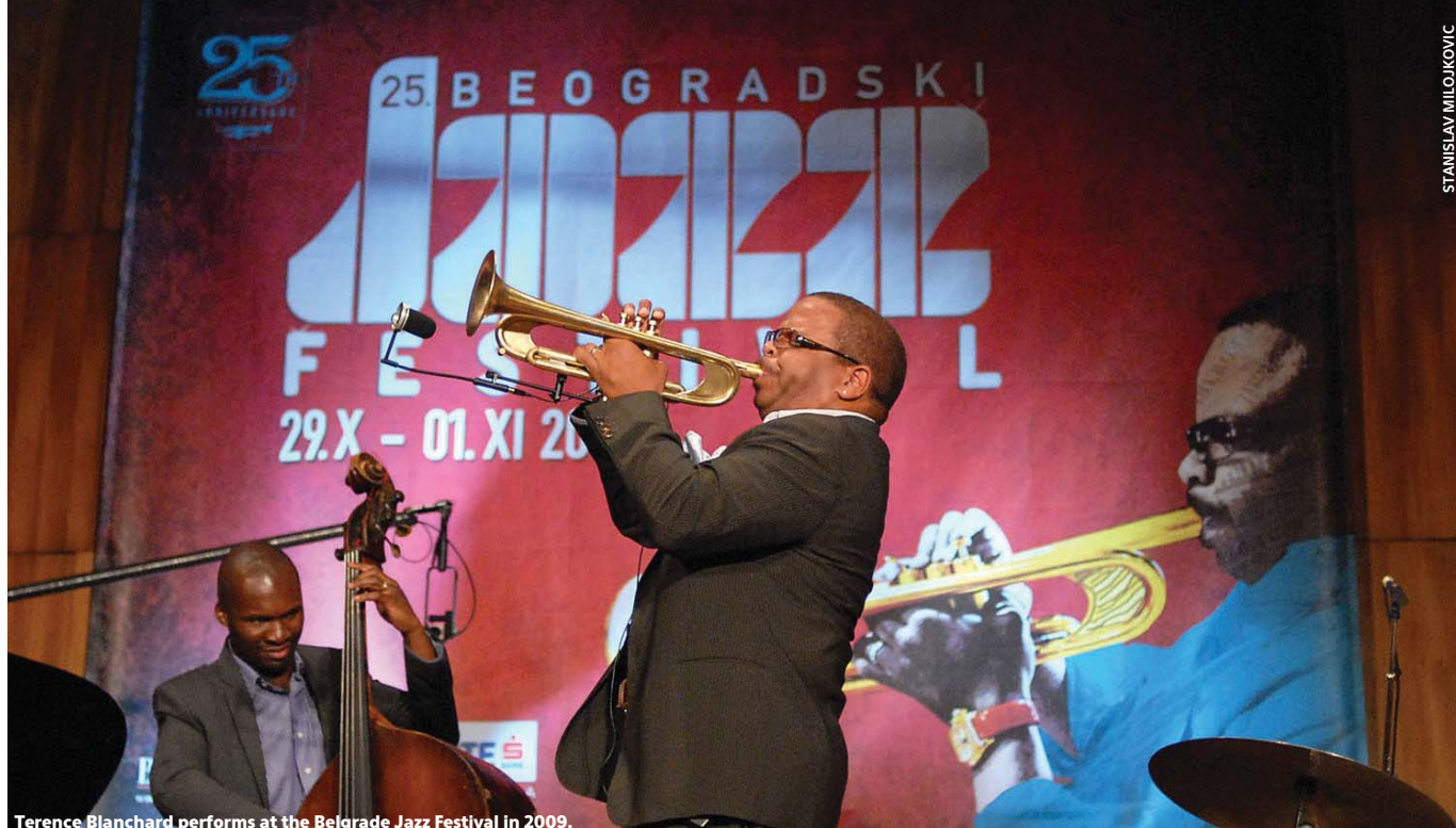
Terence Blanchard performs at the Belgrade Jazz Festival in 2009.