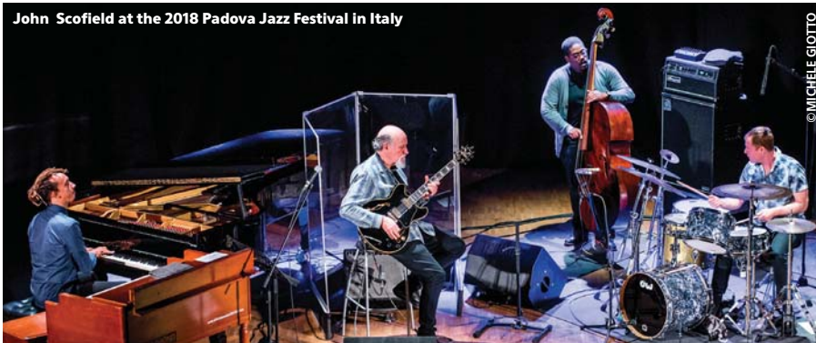
John Scofield at the 2018 Padova Jazz Festival in Italy